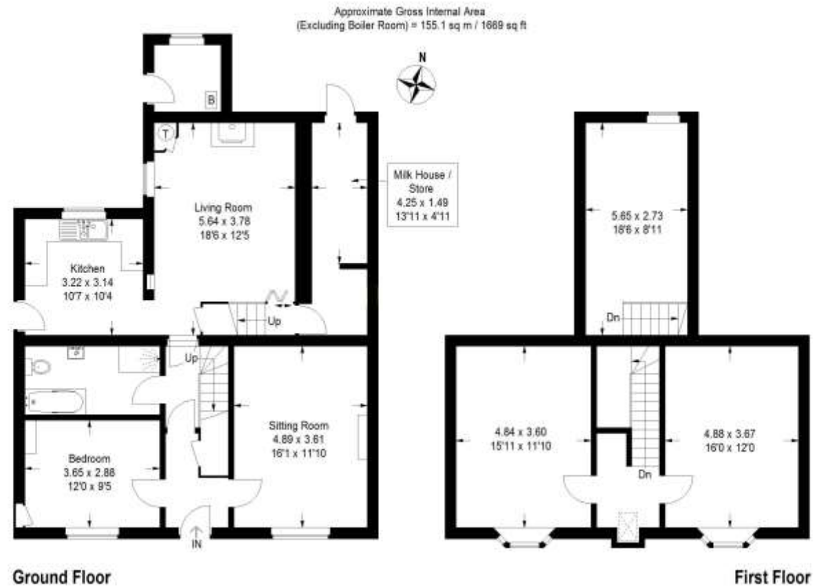
Illustration for identification purposes only, measurements are approximate, not to scale. FloorplansUketch.com © 2016 (ID255238)